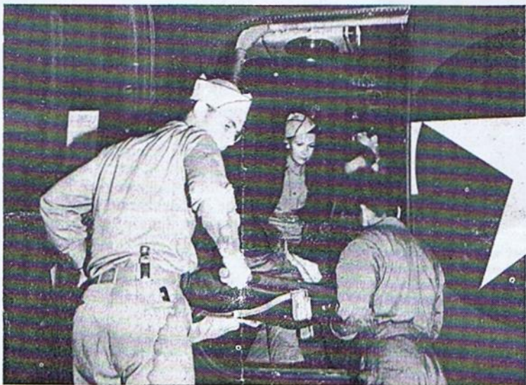
WOUNDED RETURN: Makin casualties, arriving at APO 953, are removed from a hospital transport plane in quick time.